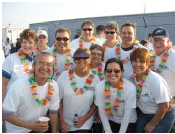
The Mighty Meeting Makers