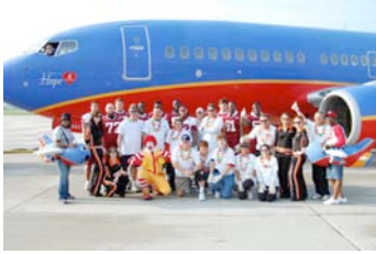
The Mighty Meeting Makers and the Temple Owls